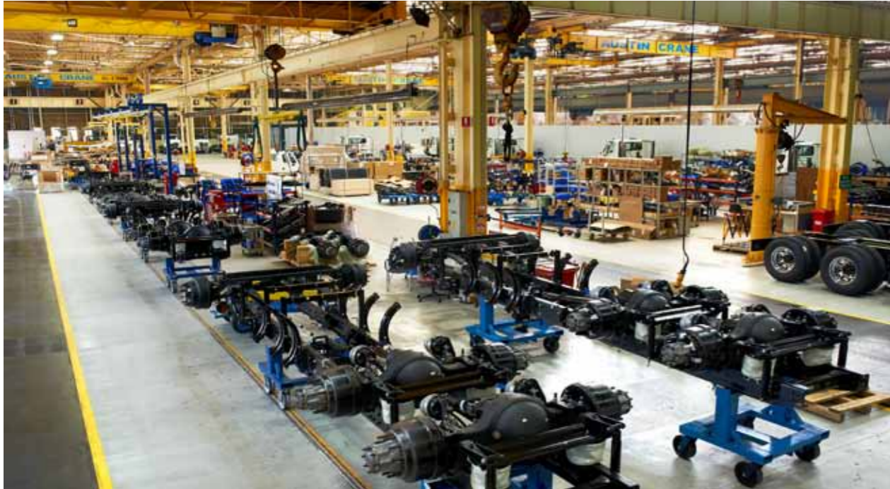
Cat truck assembly plant in Tullamarine, Victoria, Australia.

Cat trucks are assembled right here in Australia and are supported by Australia's extensive Cat dealer network. With a rugged drive train designed in North America to withstand tough road and weather conditions, Cat trucks will keep your business moving in the tightest urban conditions or the most inhospitable Australian outback.