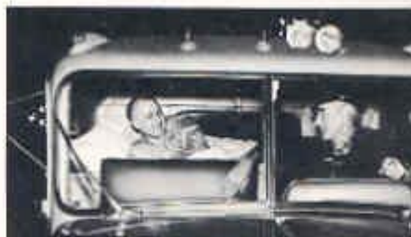
THE AUTOCAR DRIVER SLEEPER

SEAT CUSHION AND BACKREST are constructed of heavy duty steel coil springs with thick curled hair padding. Upholstery is durable, attractive simulated leather.